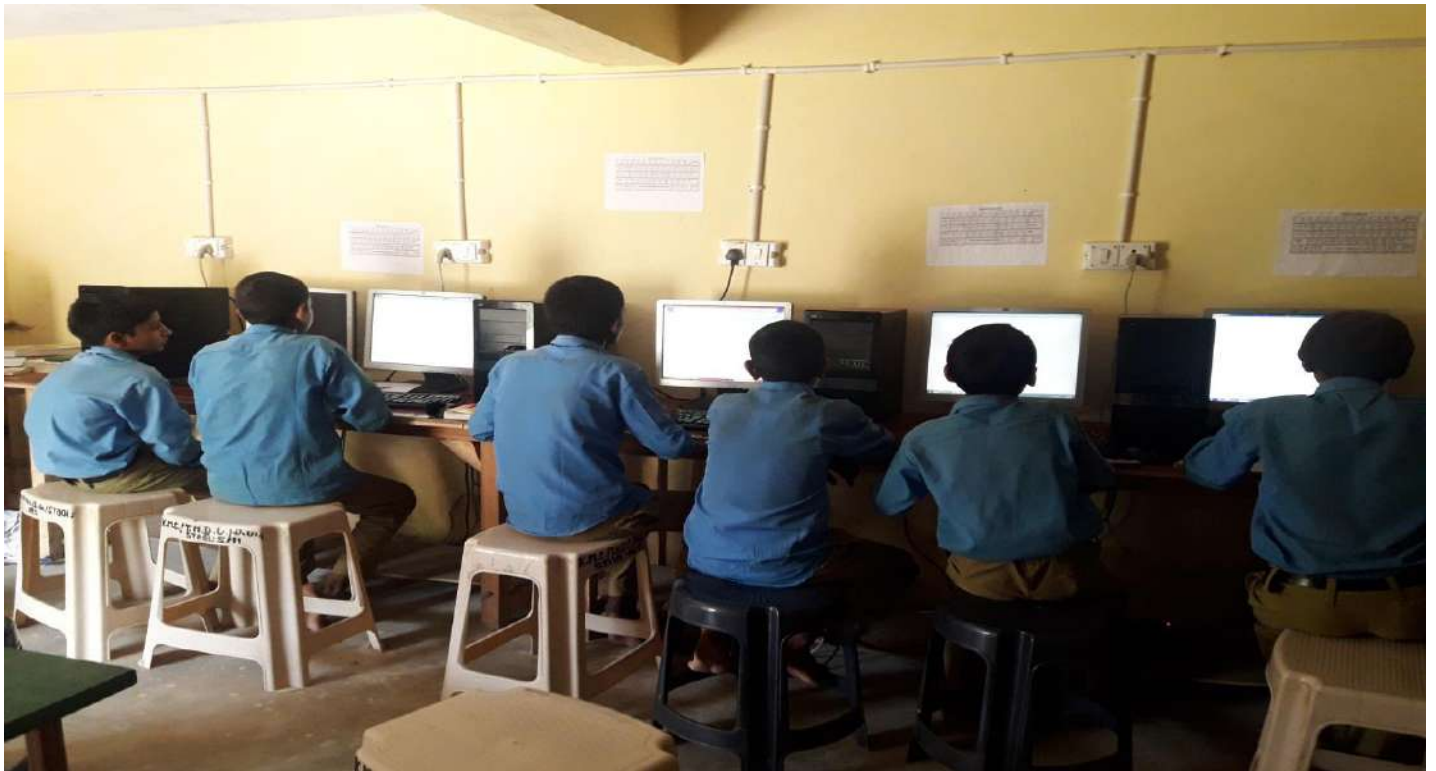
Garwan gaon school boys learning computer after and before school time