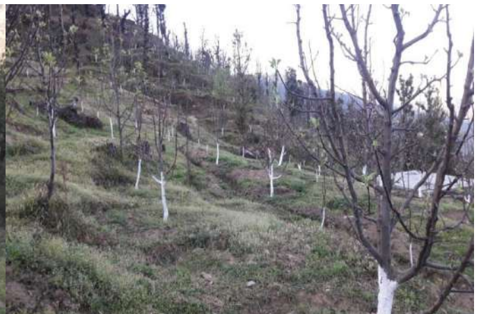
Exposure visit at Apple orchard