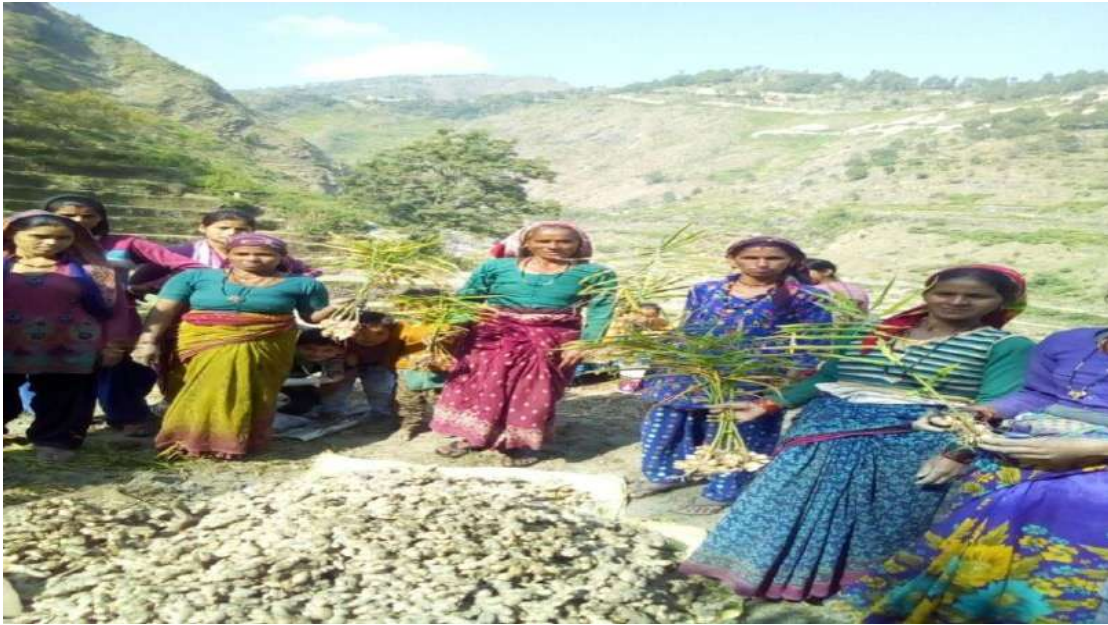
Photo graphs of Ginger production at Budkot village