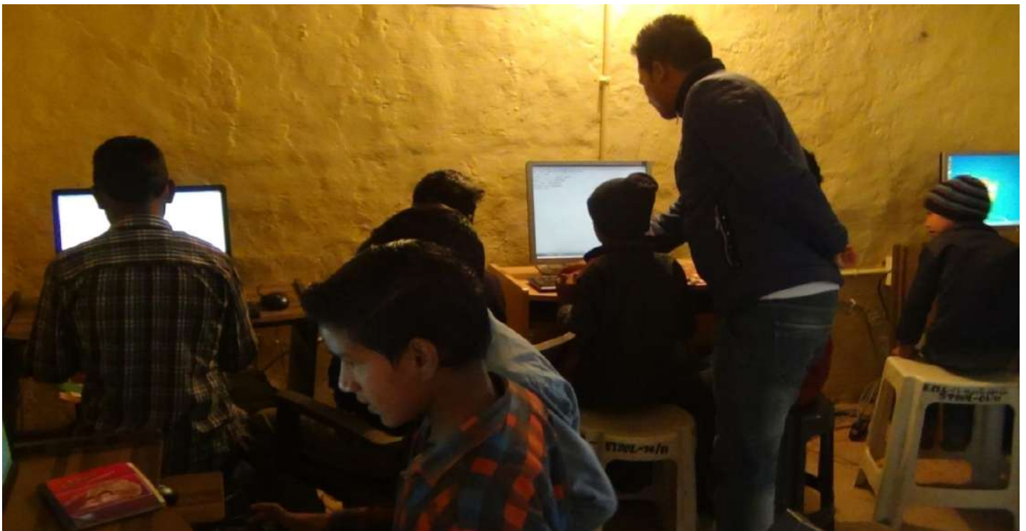
boys and girls of Deengaon and all nearest village student learning computer at deengaon center