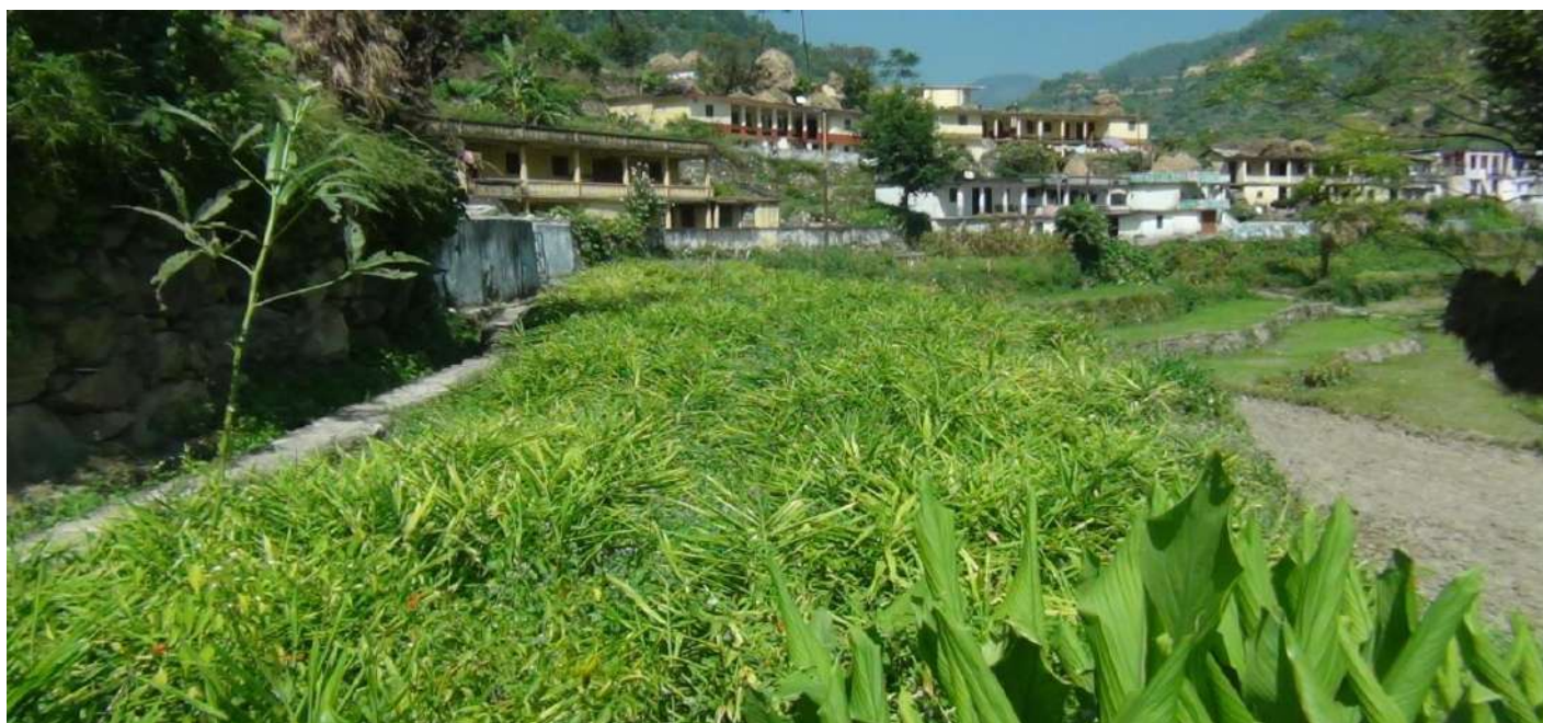
photo graph of ginger farming at sera village