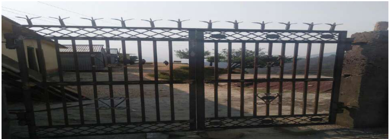
Renovation of School Gate