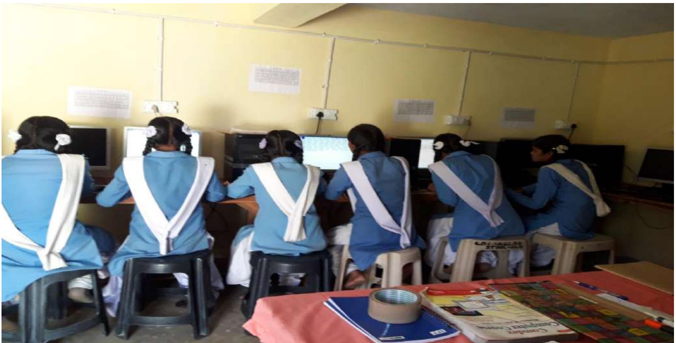
Garwan gaon school girls learning computer after and before school time