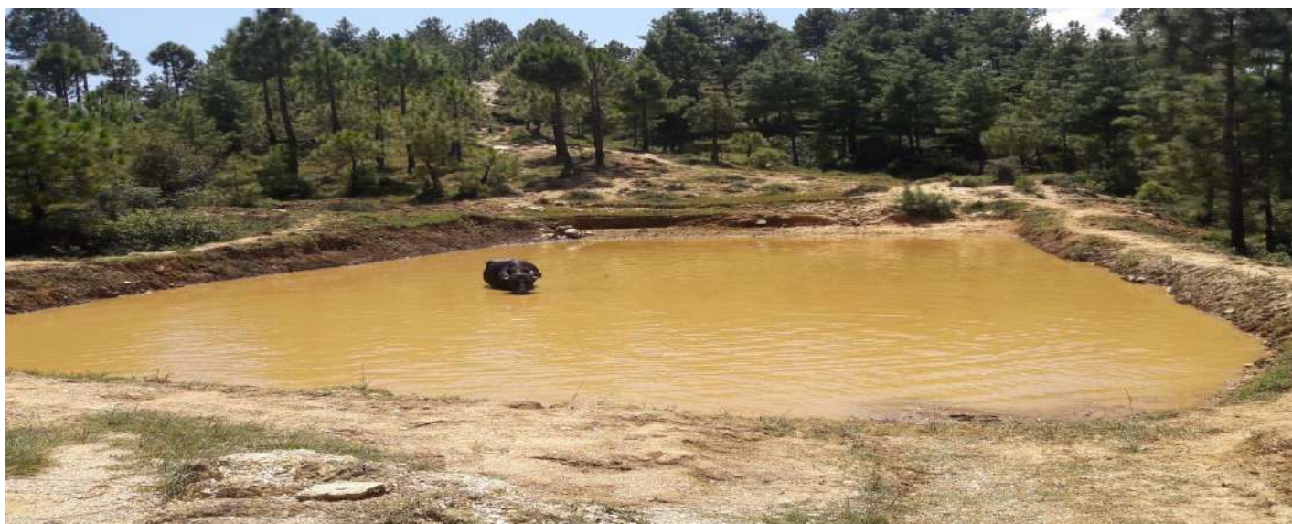
Akuli chal situated at top of Herwalgaon region and its size 24X16 its retain moisture in dry season.