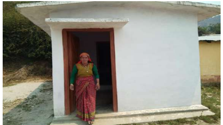
Dining Hall after repairing