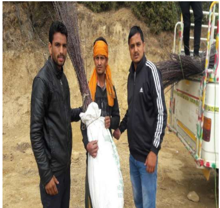
Apple plants distribution by SBSEC and THDC-SEWA at Deengaon area