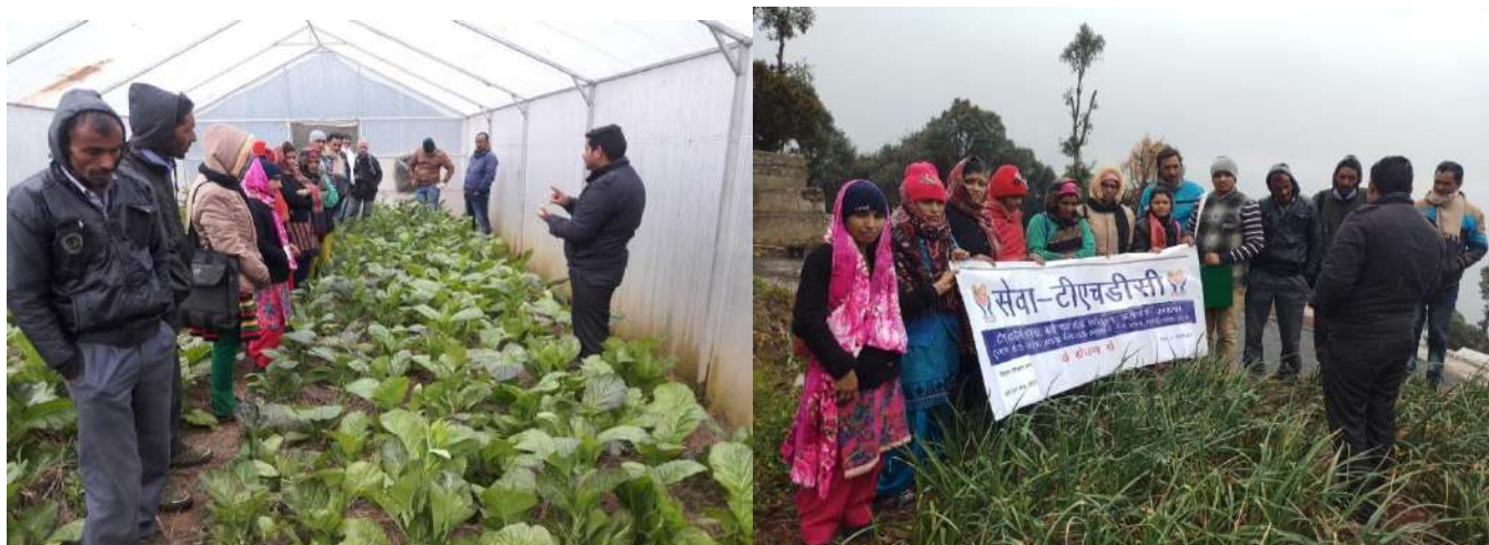
Exposure visit at Ranichouri