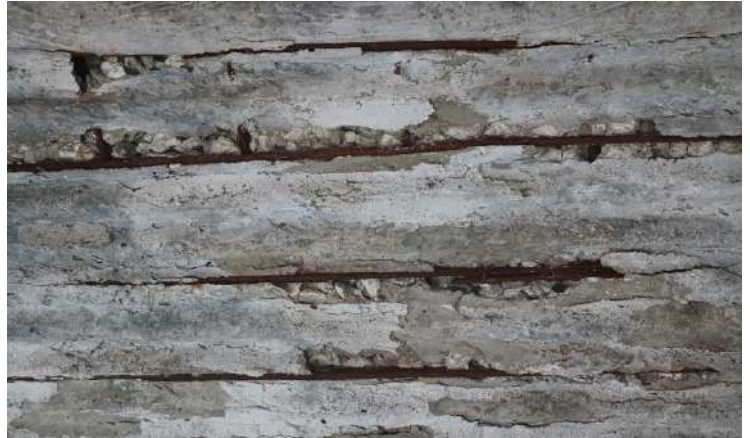
Dining Hall before repairing