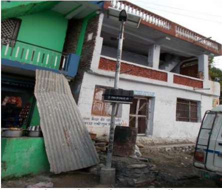
Near Residence of Sh. Balveer Bisht Village Devisaur (Sunargawn)