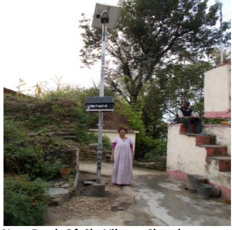
Near Resd. Of Sh. Vikram Chandra, Village Dichali (Khude)