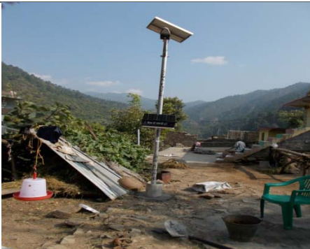
Near Resd. of Smt. Kunti Devi, Village New Khalsi