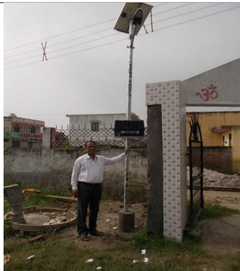
In Temple campus of Village Tehri Dobe Nagar