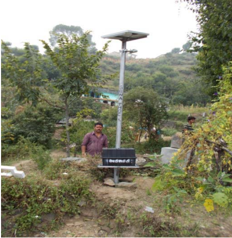
Near Resd. Of Sh. Vikram Lal, Village Dichali