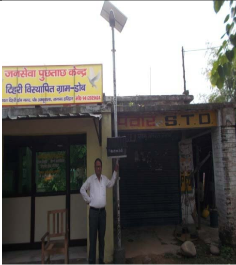
Near Jansewa Kendra, Village Tehri Dobe Nagar

ग्राम टिहरी डोबे नगर, विकास खण्ड बहादुराबाद जनपद हरिद्वार में टिहरी विस्थापित क्षेत्र में सी0एस0आर0 मद से स्थापित सोलर स्ट्रीट लाईट के लाभार्थियों के फोटोग्राफ ।