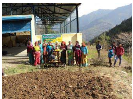
All members of farmer group, Siloli village on 22 Feb. 2019