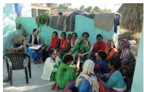
HNBGU Project team collected the all documents related the registration for the Cooperative Committee, New Tehri at Khola village on 18<sup>th</sup> October 2018