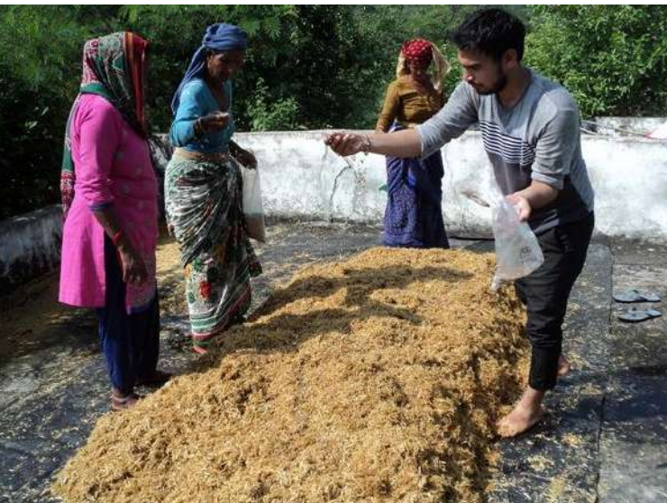
Experts of Rural Technology Deptt. HNBGU provided the Oyster Mushroom training to Women Farmers at Kathuli and Sandana villages