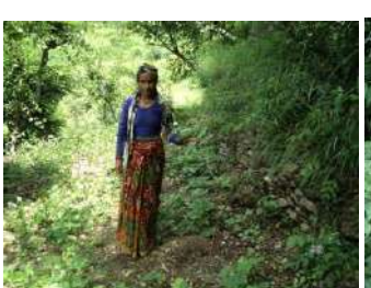
Women Farmer beneficiary of Muynda rim area village – Photo by Project team visited at Guava plantation site on 05<sup>th</sup> August 2018