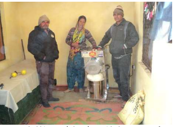
Atta Chakki 3H.P. (Dhara) provided to Women farmer Group