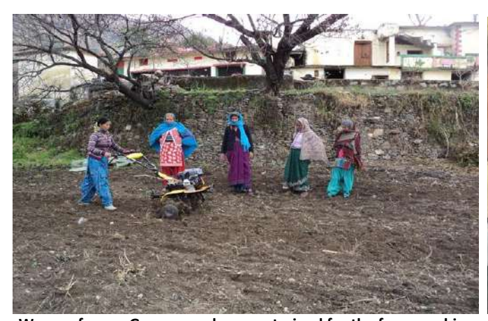
Women farmer Group members are trained for the farm machine of Power Wider Alligator 6 DPE on 18<sup>th</sup> Feb. 2019