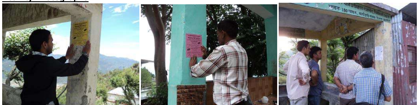
Project team popularize this scheme in many locations of the project area through displaying pump lets at different areas 02<sup>nd</sup> July 2018