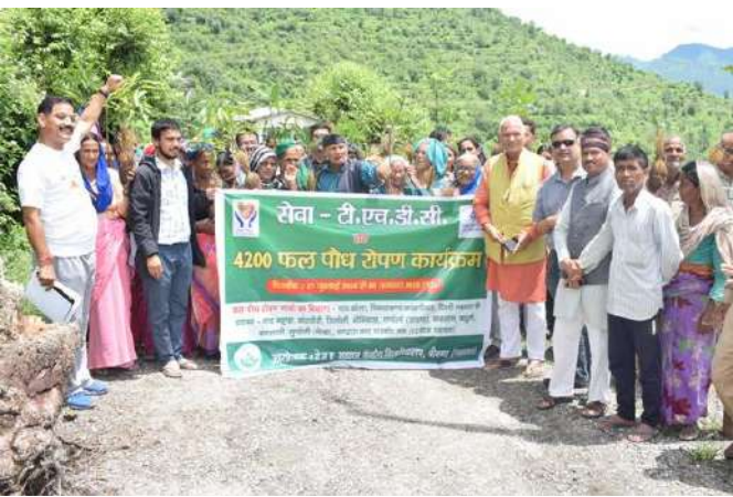
Active participation of villagers of Khola village during the Fruit Plantation activity on 29<sup>th</sup> July 2018