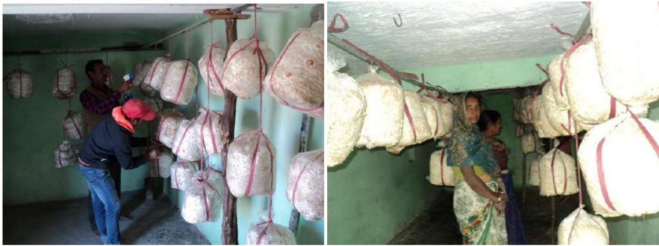
Training comprises of practical demonstration with theory and technical guidance