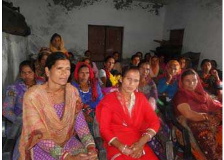
Local villagers are participated during the Kissan Gosthi on 27<sup>th</sup> May 2018 at Panchyati Bhawan, Pathuri