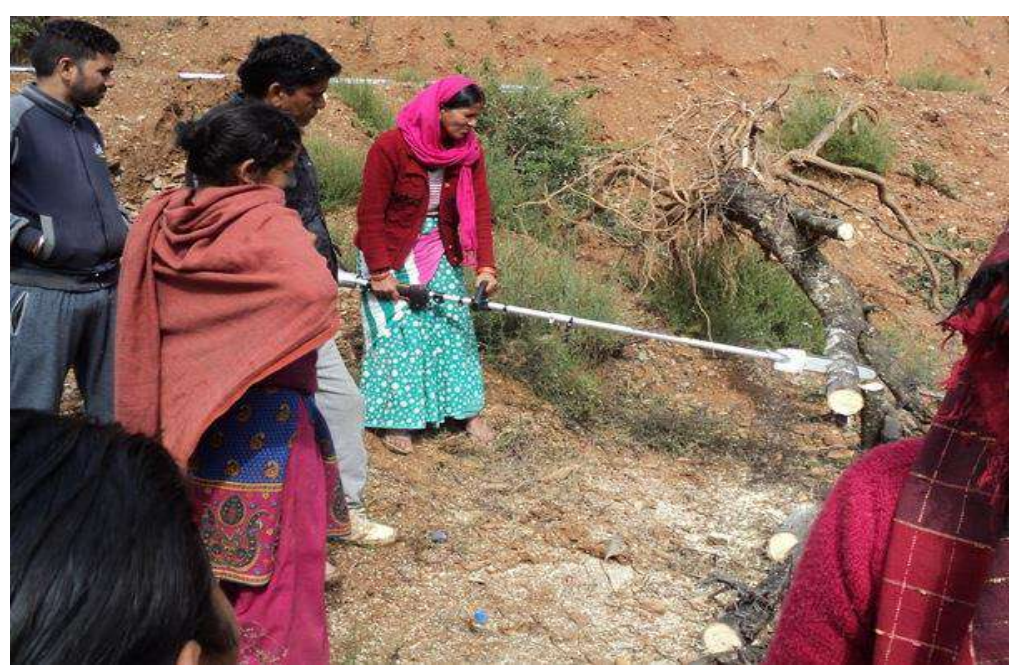
Women getting the training of Chain Saw KK 5920 on 22 Feb. 2019