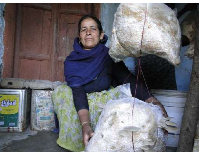
Self-help groups of women who grow mushrooms collectively in villages Pachri