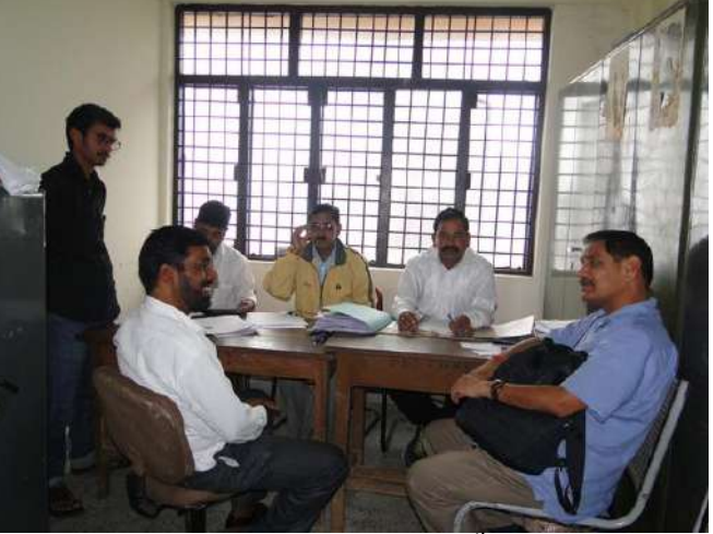
HNBGU Project team visited regarding admission to ITI Chamba and interact with officials on 08<sup>th</sup> August 2018