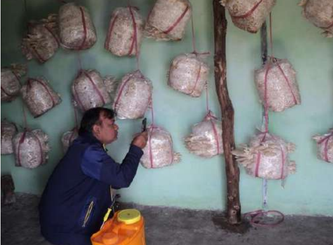
SEWA-THDC & HNBG Introduced oyster mushroom cultivation technique in the 05 villages of Project area