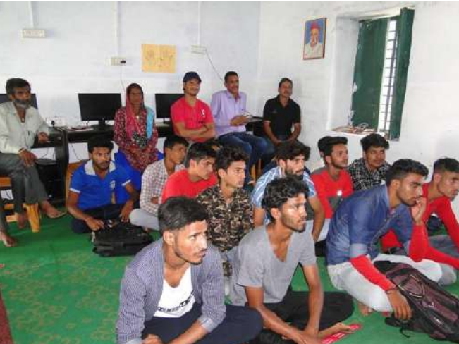
A preliminary interview with candidates was conducted at Champadhar (Kathuli) Centre on 15<sup>th</sup> August 2018