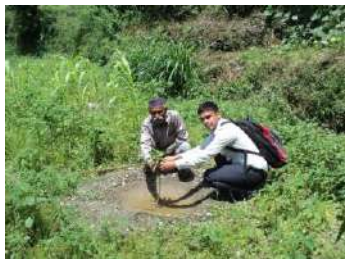
beneficiary with Mango plantation site at Bangdwara village – Photo by Project team on 12<sup>th</sup> August 2018