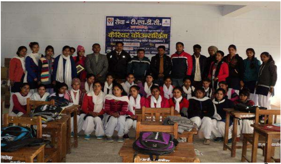
Group Photographs of Participants at Govt. Degree College, Agrora during the Carrier Counseling on 04<sup>th</sup> Jan. 2019