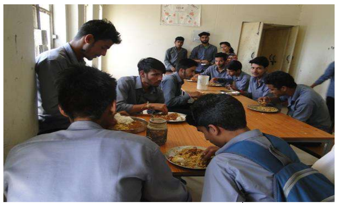
All students are Rim area in the Mess at ITI Chamba on 08<sup>h</sup> October 2018

11. Hospitality Training (Hunnar Se Rojgar course of 03 months and extended course of 06 months) including on job training to 25 students through Govt. Hotel Management Institute, Garhi Cantt. Dehradun. Beneficiaries to be selected transparently from all affected blocks by giving advertisement in local News Paper and following some criteria. Selection can also be done by Entrance Exam conducted by the Institute if any.