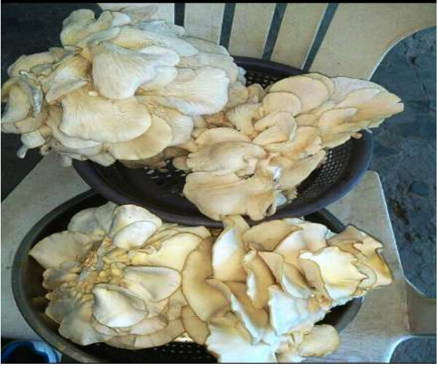
Mushroom production at Pachri village