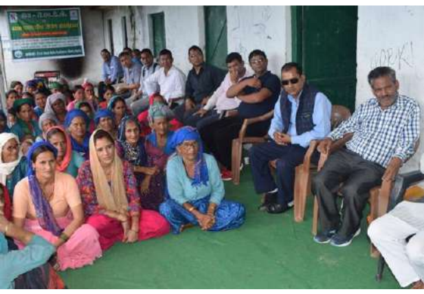
Participant of villagers and others duting the programme at Panchyati Bhawan, Khola on 29st July 2018