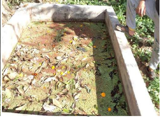
Azola Pond 07: Mrs. Syama Devi w/o Sumedu Lal (SC), Village Paturi – Photo on 16<sup>th</sup> December 2018