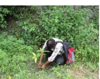
HNBGU Project Team monitoring of Mango Plant site- at Khola village - Photo on 06 October 2018