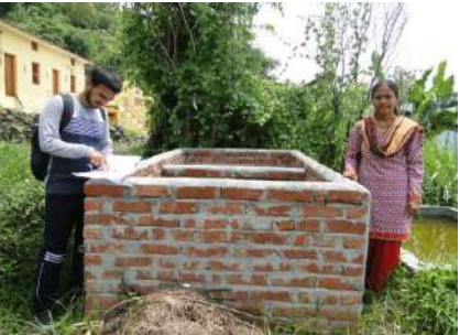
HNBGU Project Team visit at Vermi compost pit spot at Gandoli– Photo on 24<sup>th</sup> July 2018