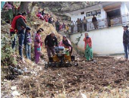
All villagers getting the training at Banalee village on 17 Feb. 2019

9. Carrier Counseling in 05 intermediate Colleges to be identified in consultation with Nodal officer