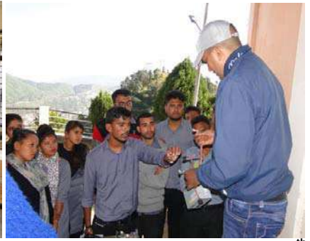
Students of COPA Trade – Photo on 08<sup>th</sup> October 2018