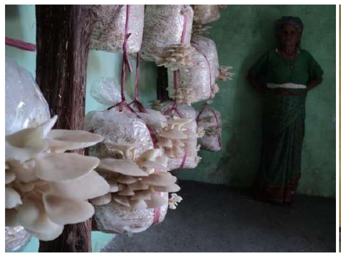
Gram Pradhan Rama Devi village Kaflog - Total 34 kg. Dingri Mushroom sale (@ 200/- per kg.) and net earn profit Rs. 6,800/-