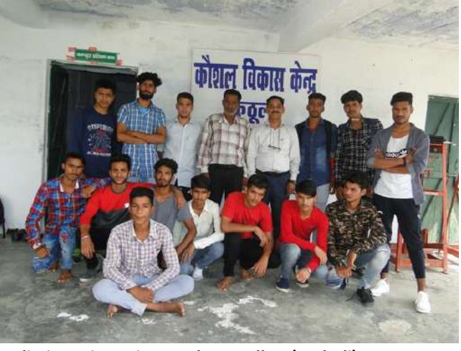
Applicants interact with project team during the preliminary interview at Champadhar (Kathuli) Centre on 15<sup>th</sup> August 2018