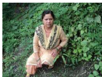
beneficiary with Mango plantation site at Siloli village on 14<sup>th</sup> August 2018