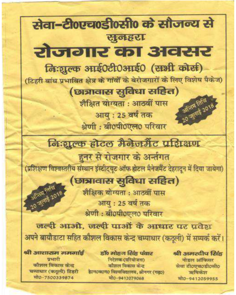
Aadvertisement and pamphlets displayed in the project area to mobilize unemployed youths for ITI and hospitality Training