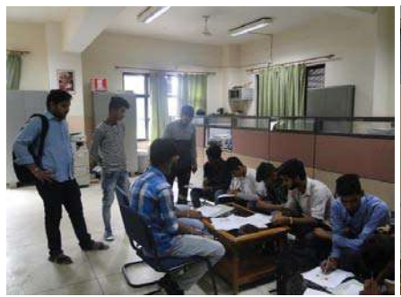
IHM Dehradun admission process started and selected applicants from Pratapnagar and Jakhnidhar block, Rim area villages are filling application forms for admission at IHM, Dehradun on 27<sup>th</sup> August 2018