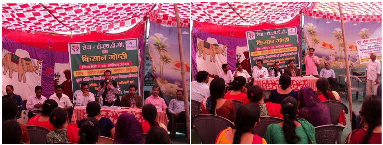
Experts from different division of Government Department, THDCIL Officers, HNBGU Team and farmers during the Kissan Goshti on 26<sup>th</sup> April 2018 at Champadhar (Kathuli), Jakhnidhar Block, Tehri Garhwal