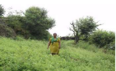
<u>Site selection: 08 –</u> Laxmi Devi w/o Sabbal Singh– Kathuli village - site selection for the Poly house on 02<sup>st</sup> October 2018