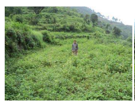
<u>Site selection : 04 -</u> Beneficiary Bharat Lal S/o Kera Lal at Kaflog village - site selection for the Poly house on 05 August 2018