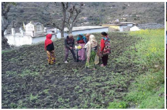
Women giving the training of Post Hole Digger E-52 on 20 February 2019