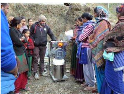
Women farmer group's members are trained the farm machinery equipments on 19<sup>th</sup> Feb. 2019