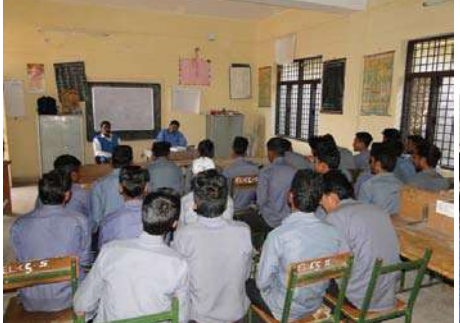
Students of the Electrician Trade at Class room – Photo on 08<sup>th</sup> October 2018