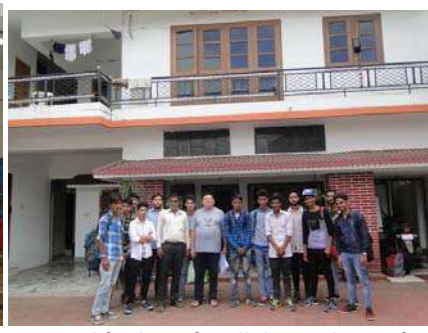
Hostel facilities for all the students of HM Cource, at Hotel Residency, Dehradun on 27<sup>th</sup> August 2018