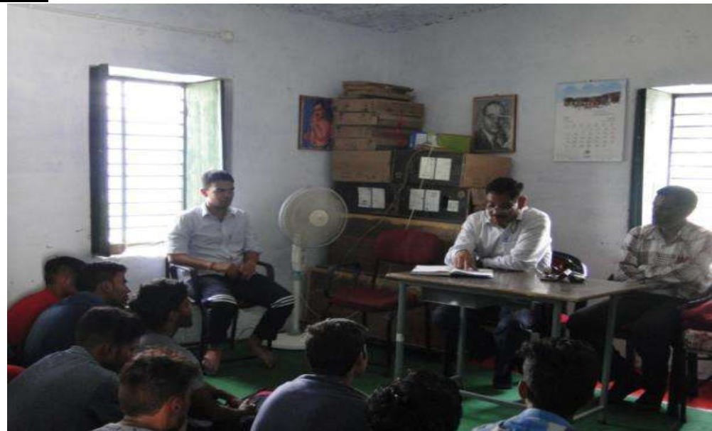
Counseling with applicants of hotel management, at Champadhar (Kathuli) Centre on 15<sup>th</sup> August 2018