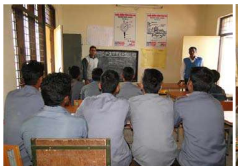
Students of the Fitter Trade in the Class room – Photo on 08<sup>th</sup> October 2018