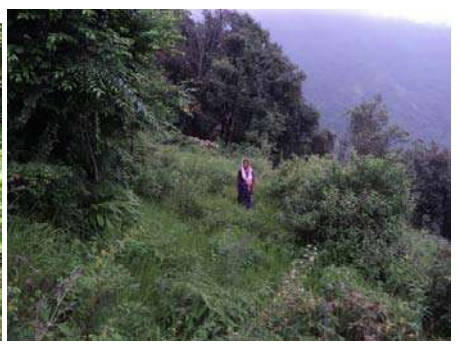
<u>Site selection: 06-</u> Beneficiary Laxmi Devi w/o Pancham Singh – Bhunidhar Tok at Dharkot village - site selection for the Poly house on 07<sup>th</sup> August 2018