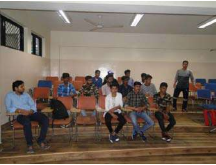
Group discussions with the students and HNBGU Staff at IHM, Dehradun on 27<sup>th</sup> August 2018