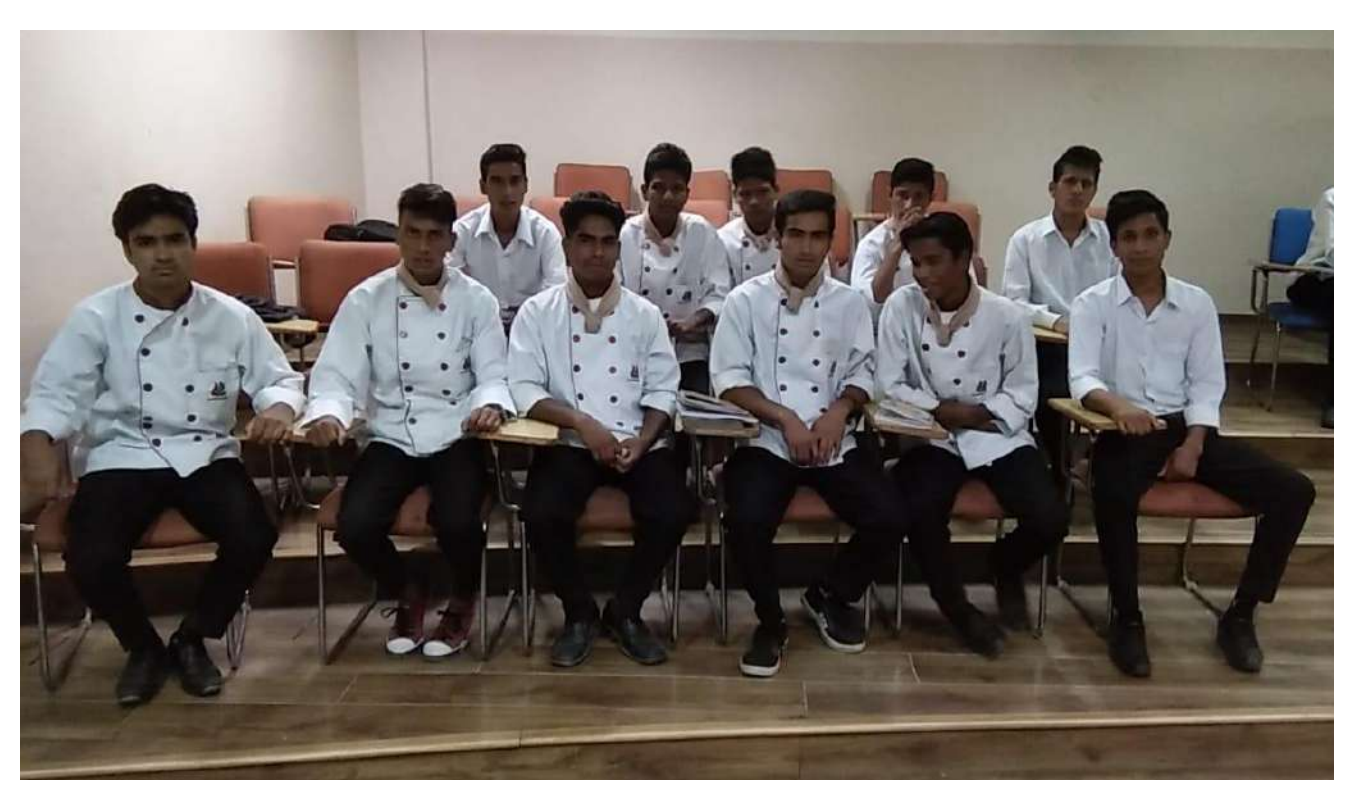
The all youths from rim area villages, Tehri Garhwal in the class room at IHM, Dehradun on 28<sup>th</sup> September 2018