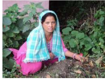
beneficiary with Awala plants at Kotchuri village on 15<sup>th</sup> August 2018