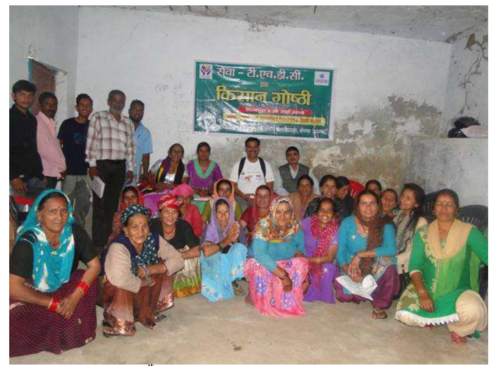
Participants during the Kissan Goshti on 27<sup>th</sup> May 2018 at Panchyati Bhawan, Paturi, Jakhnidhar Block, Tehri Garhwal

5. Distribution of Seasonal vegetable seeds after Kissan Gosthi for promotion of Kitchen Gardening considering 50 farmers in each Gosti (250 farmers)