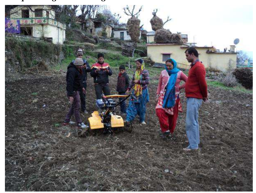
Women farmer group's member, village Bangdwara get the training of Power Wider Alligator 6 DPE on 18<sup>th</sup> Feb. 2019