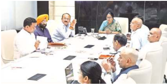
At the Cabinet meeting on Tuesday.