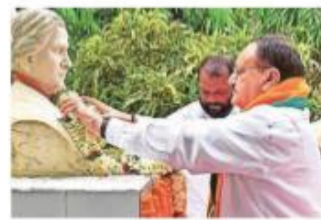
J P Nadda pays tributes to writer Sarat Chandra Chattopadhyay in Howrah, Saturday.

"The kind of violence that took place in the recent panchayat elections has reminded us of the violence which took place during India's independence struggle. Mamata Banerjee's party workers, who should be called goons, unleashed a reign of terror during the election. Our party workers were prevented from filing nominations, their family members were beaten up, rampant electoral malpractices took place on the day of polling and violence also took place on the day of counting. The police not only remained inactive but also threatened our workers when they went to lodge complaints. In a nutshell, the TMC murdered democracy in Bengal. The democratic set up here has